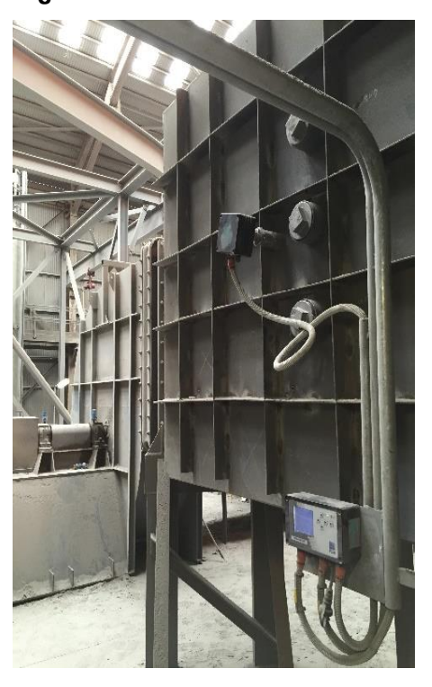
Figure 3: Cement Mill 3 Exhaust Duct